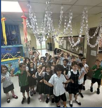
Reading Chain Winners!