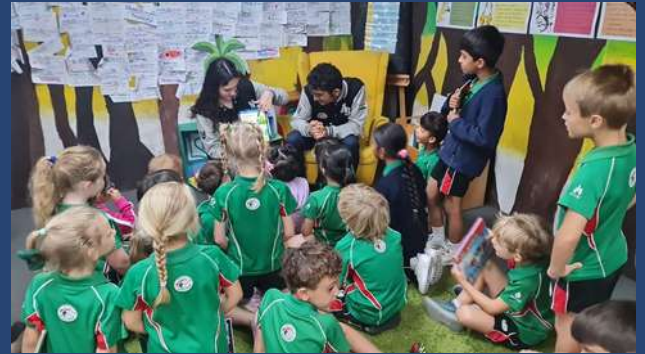
Secondary students reading with Year 2