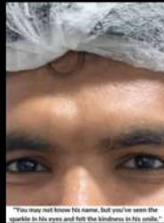
"You may not know his name, but you've seen the sparkle in his eyes and felt the kindness in his smile."