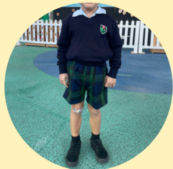
Fully compliant uniform