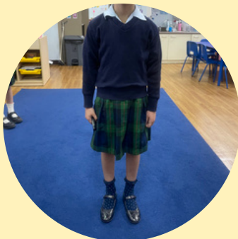
Acceptable example of a non DIA jumper

As the colder months set in, please be reminded about uniform. If children are feeling the cold please ensure that they are sent in with clothing that meets the uniform standards.